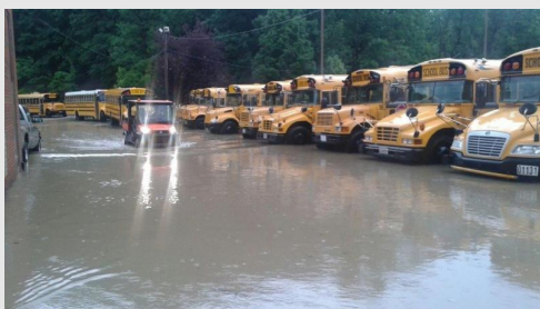
BEFORE: Flooding was prevalent at the Bedford City School District bus garage.