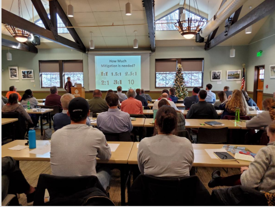
ABOVE: Winter workshop attendees listen to presentations