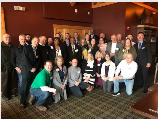
ABOVE: TCWP staff, Board and local mayors gather for a group photo.

Want event dates to put on your fridge? Click here to be added to a physical mailing.