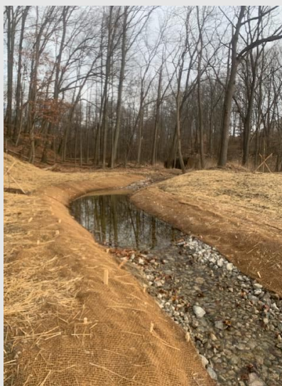
AFTER: This unnamed tributary has been given a floodplain and more stable banks.

Get involved! Check out events near you!