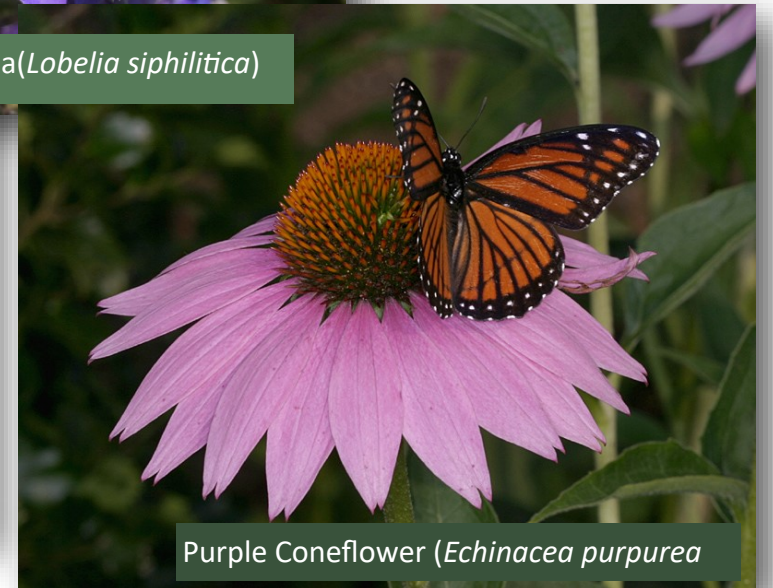
Purple Coneflower ( Echinacea purpurea )