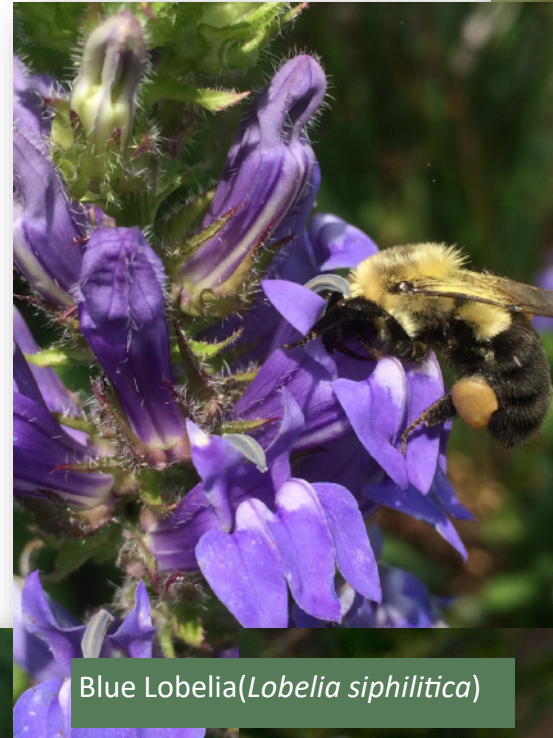
Blue Lobelia ( Lobelia siphilitica )

Ohio Native Plant Month encourages everyone to plant native. Planting native trees is one of the greatest things you can do for future generations. We also encourage folks to plant pocket pollinator gardens, no garden is too small!