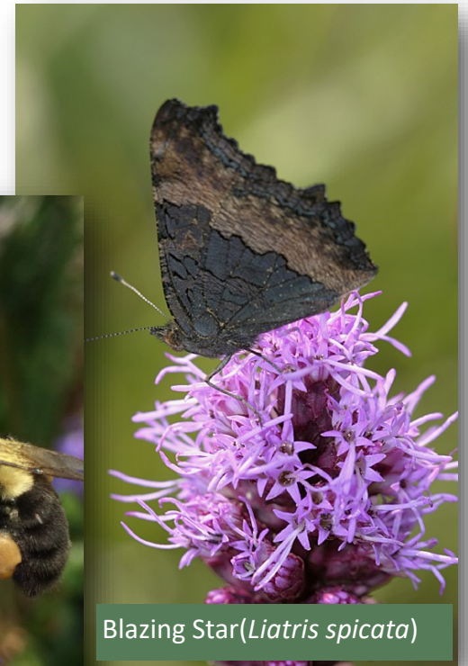
Blazing Star ( Liatris spicata )