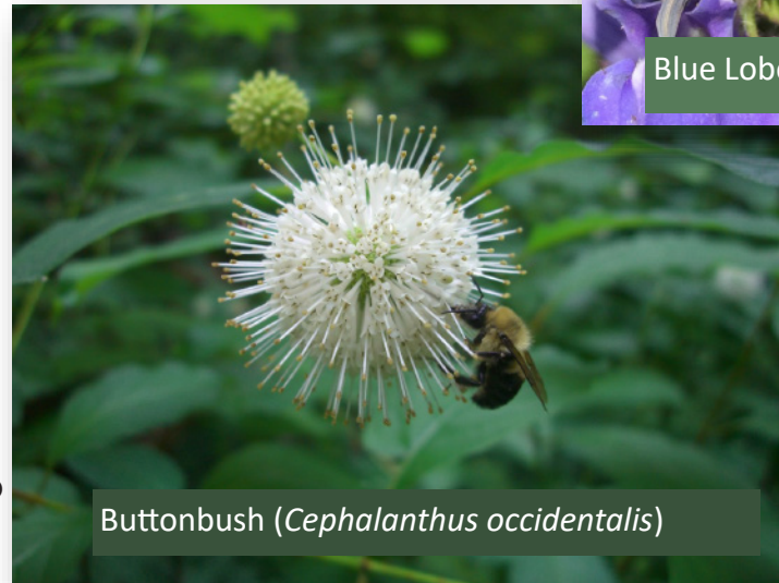
Buttonbush ( Cephalanthus occidentalis )